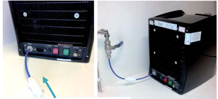
Direction of Flow Arrow

Connect ¼" flexible tubing to the Reducer and the Water Supply.